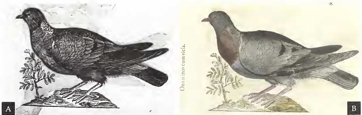
Figure 1A. Aldrovandi (1600: 499), a Stock Dove, and the lectotype of S. oenas as designated here; B. Watercolour version of same.

with locality data, vs., at the other extreme, an unvouchered individual discussed in an old text. In my view, there is an exceptional need in this case for a neotype. First, the present situation of acquiescence in the usage of established names is untenable under the Principle of Priority. Clarification of the type for livia , combined with ICZN action on the issue of priority, is the more correct means to stabilise nomenclature. Second, designating any of the possible lectotypes for livia could disrupt subspecies taxonomy, which would depend upon the ancestry of an unavailable specimen. Third, livia is one of the most commonly used bird names for an abundant and economically important species of worldwide distribution, making this an exceptional case. Uncertainty caused by a mixed type series is undesirable and lectotypification is an inadequate remedy in this case.